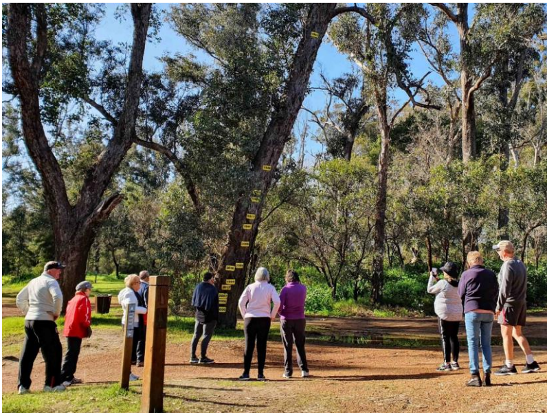
Four caravans left on Sunday, the rest left on Monday.